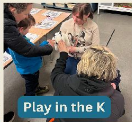
Play in the K