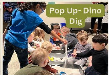
Pop Up- Dino Dig