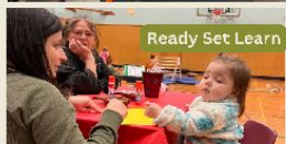
Ready Set Learn