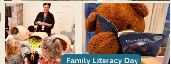
Family Literacy Day

www.pacificrimchildren.ca @pacificrimchildren