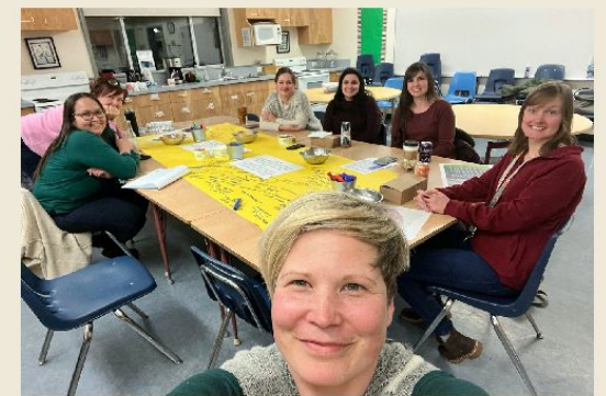
SEY2K PA Team Feb Connection Meeting