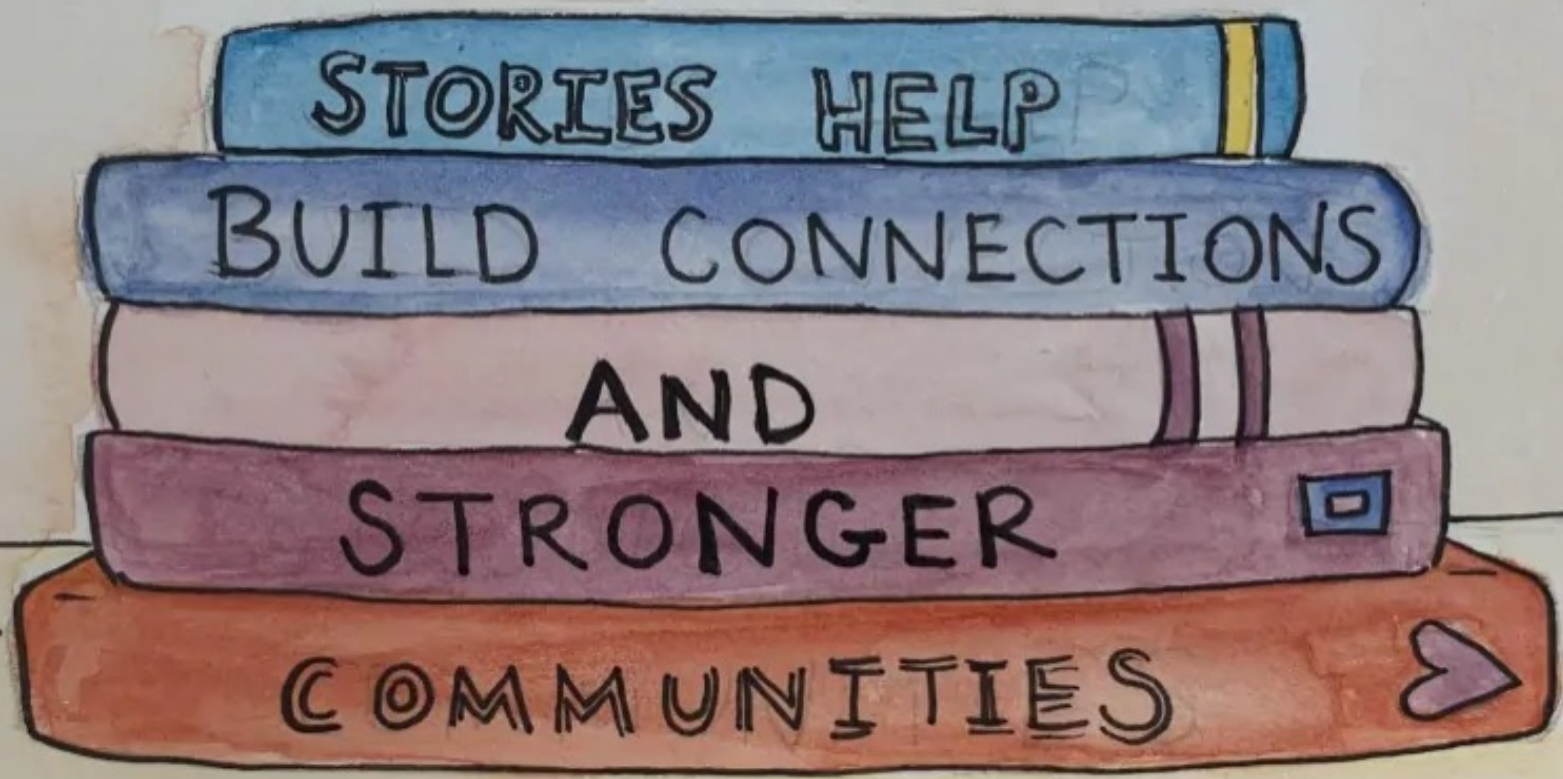
Illustration by Katie Rowe/CBC